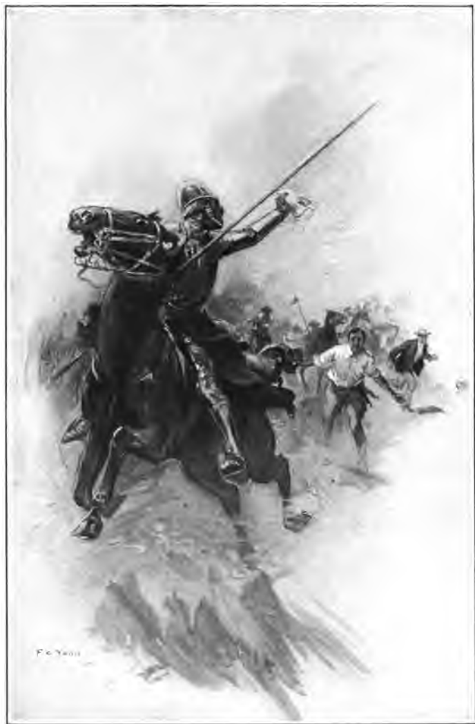
But every knight and every mounted policeman took out after the outlaw.